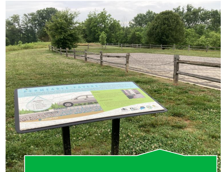
Parks and Recreation